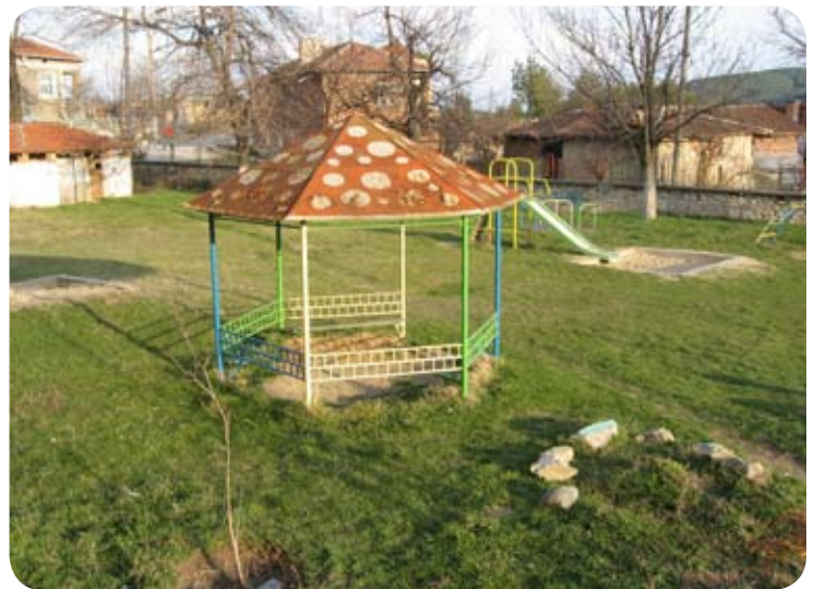
Lesichovo Orphanage Playground