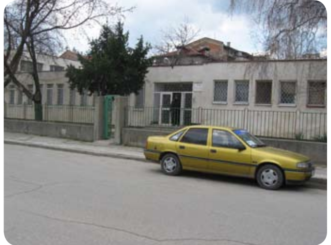
Baby Orphanage in Pazardzhik